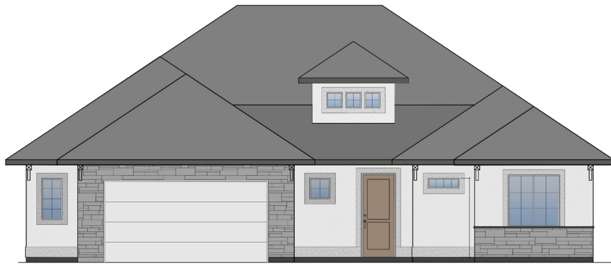
ELEVATION OPTION 2