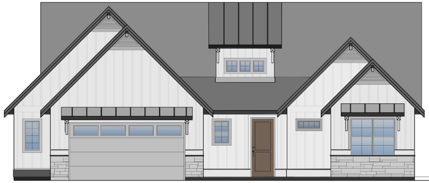
ELEVATION OPTION 1