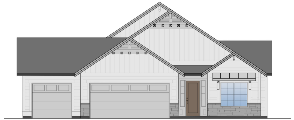
ELEVATION OPTION 3